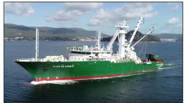
Belize flagged fishing vessel "PLAYA DE AZKORRI"

By way of background, the Marine Stewardship Council (MSC) is an international non-profit organization that recognizes and rewards efforts to protect oceans and safeguard seafood supplies for the future. Their mission is to use their ecolabel and fishery certification program to contribute to the health of the world's oceans by recognizing and rewarding sustainable fishing practices, influencing the choices people make when buying seafood and working with their partners to transform the seafood market to a sustainable basis.