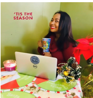
Celebrates her birthday on December 25, 2020

As a result of the interventions by many member countries an extraordinary meeting was called on 22nd December in which the Commission was able to reach consensus for the adoption of conservation measures for tropical tunas for 2021.